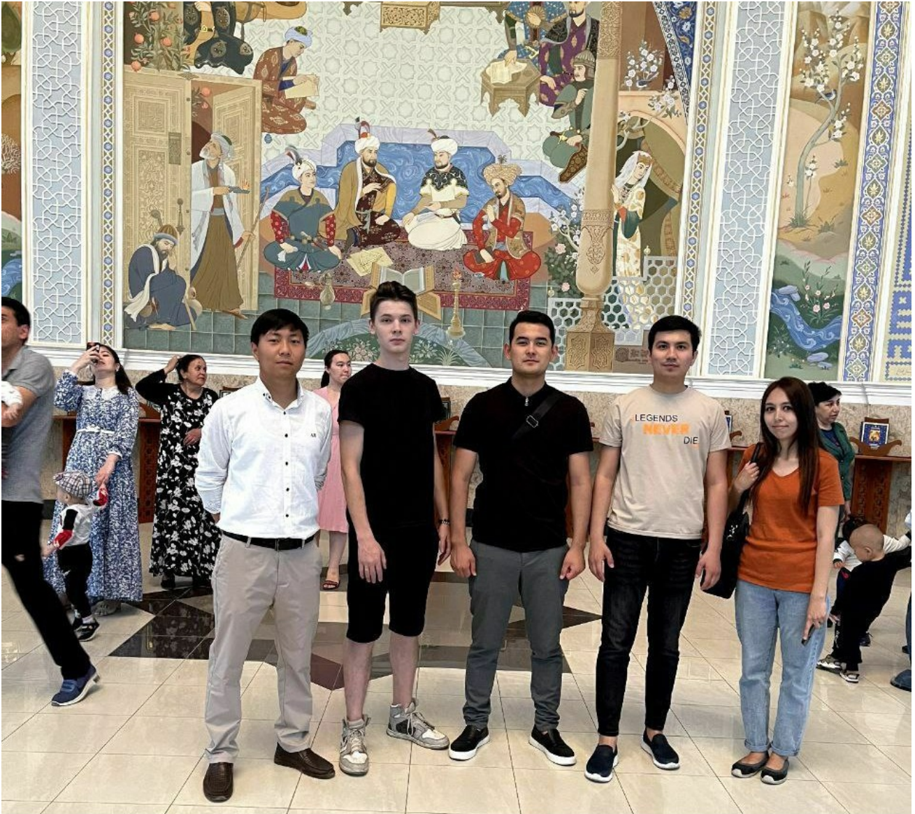
Visit of the students of GTQ educational direction 307 group to the Amir Temur Museum