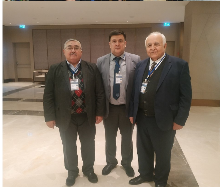
Participation of professors and teachers of the department in international conferences and seminars