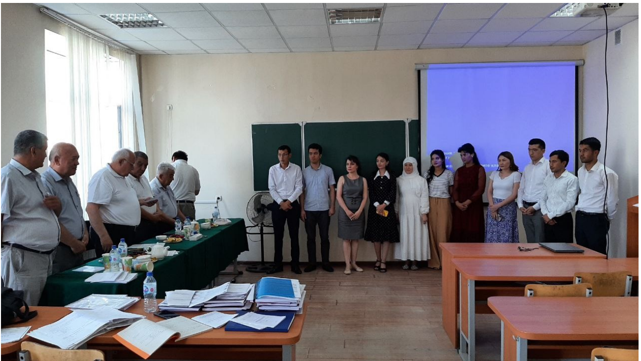
Photographs of the results of the master's defense of graduating masters