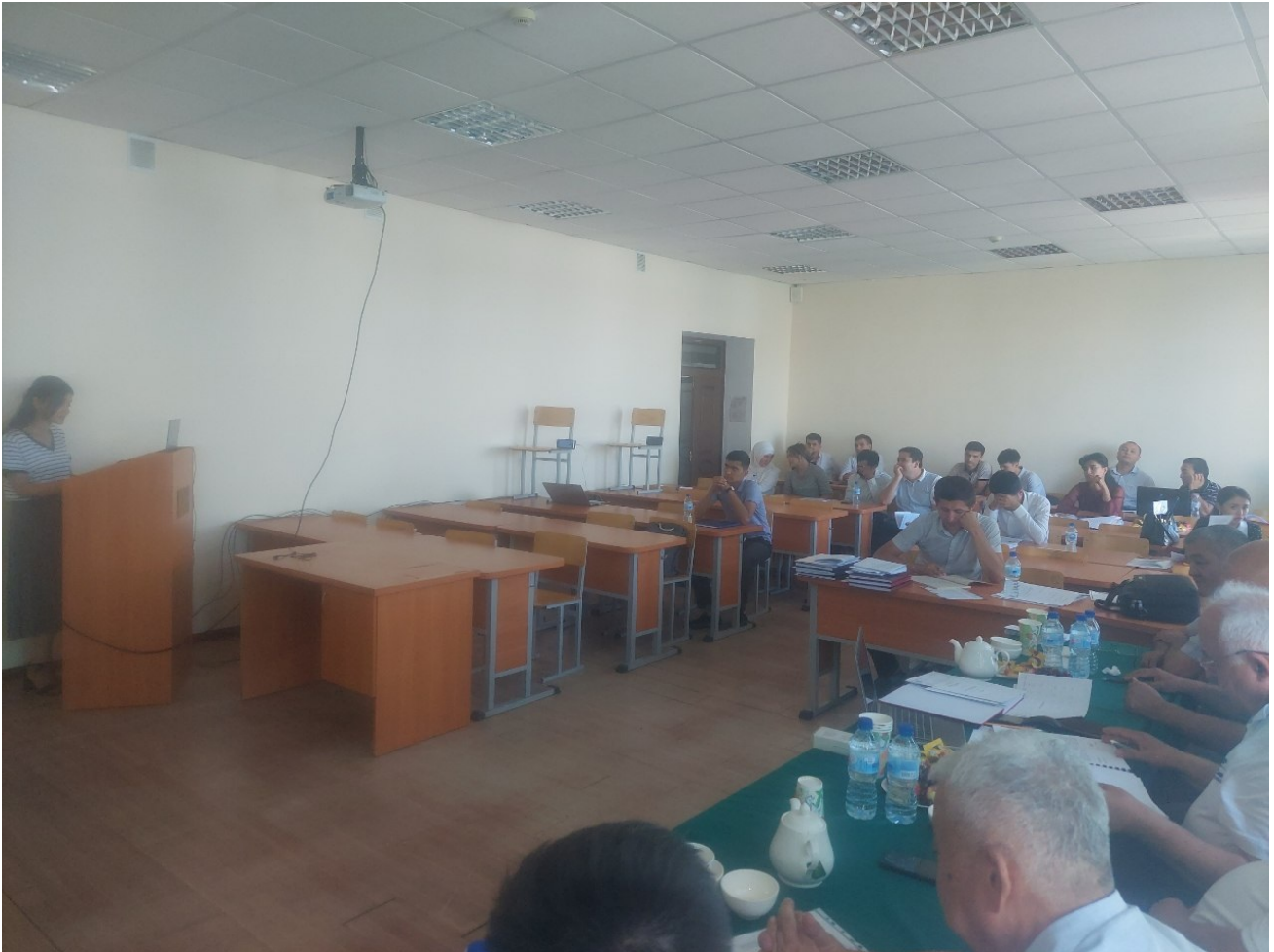
Photographs from the defense of the State Attestation Commission of undergraduate students