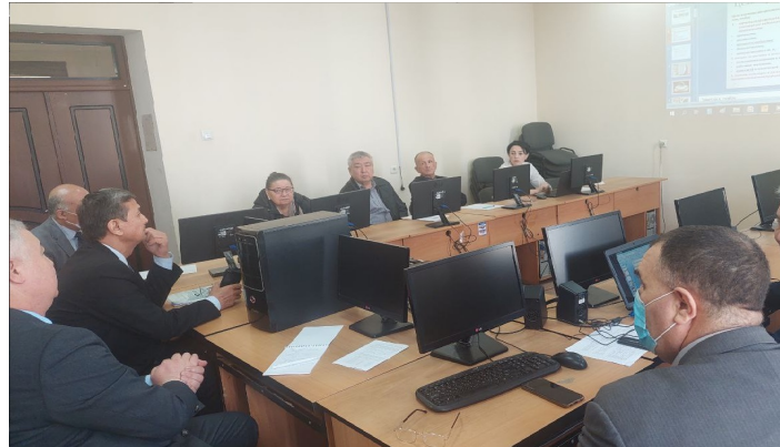
Lessons in quality group photos