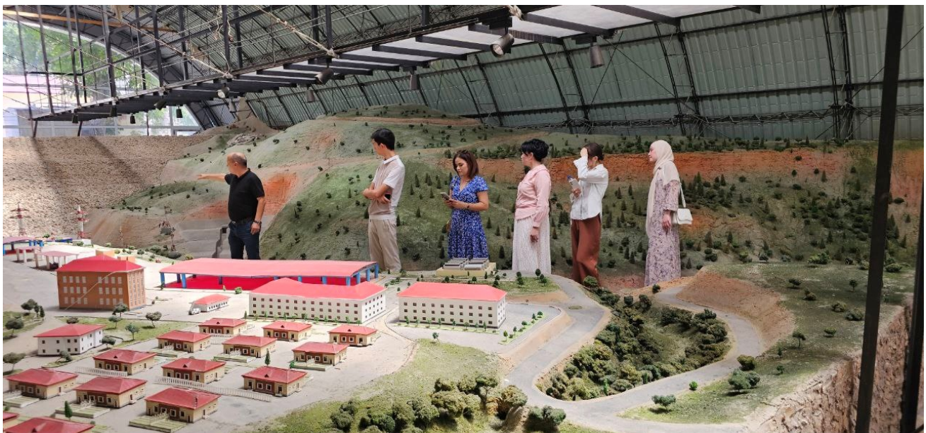
Photographs of educational practice (water intake link from the Chirchik river to the Bektemir canal)