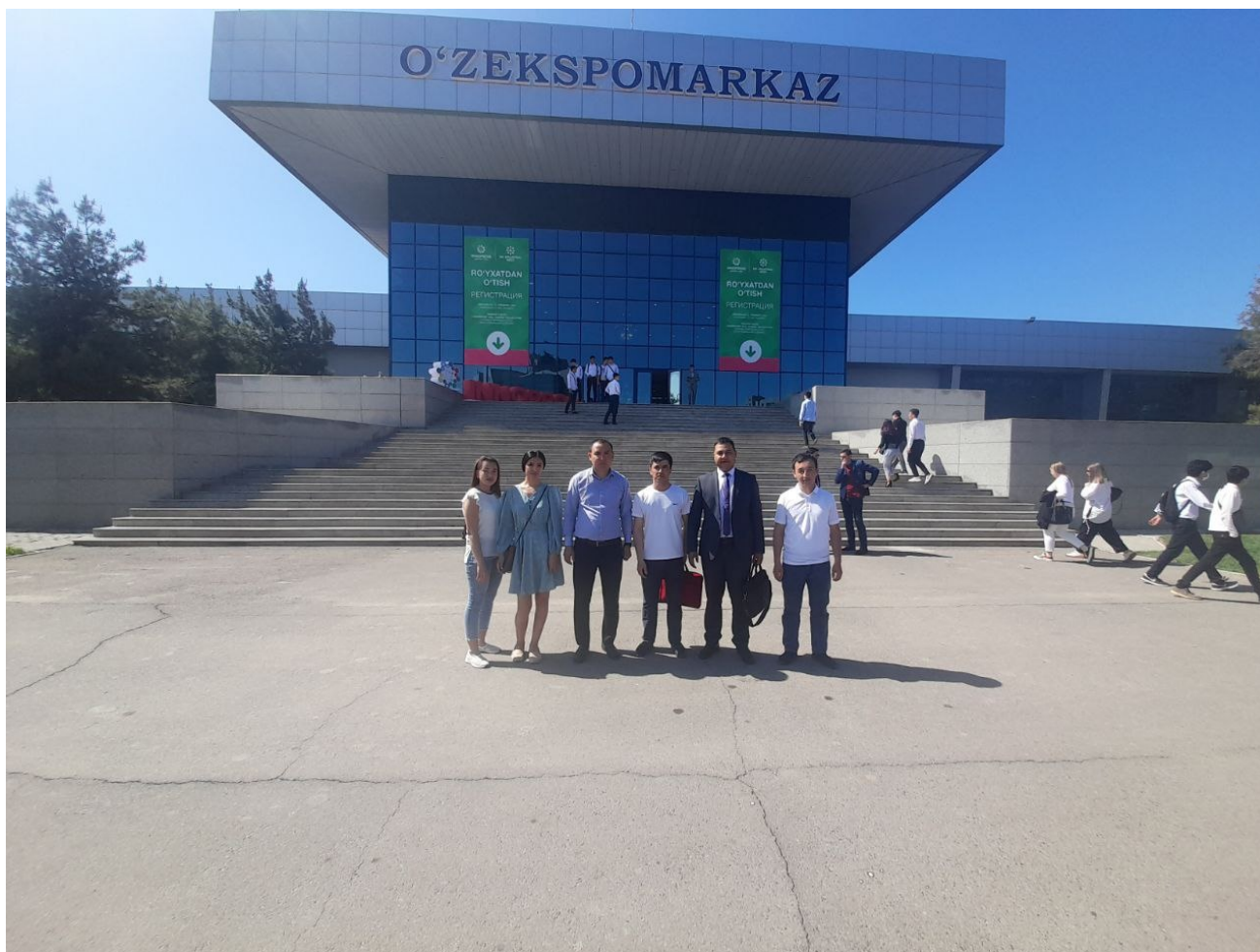
Visit of graduate students to the Uzexpo Center