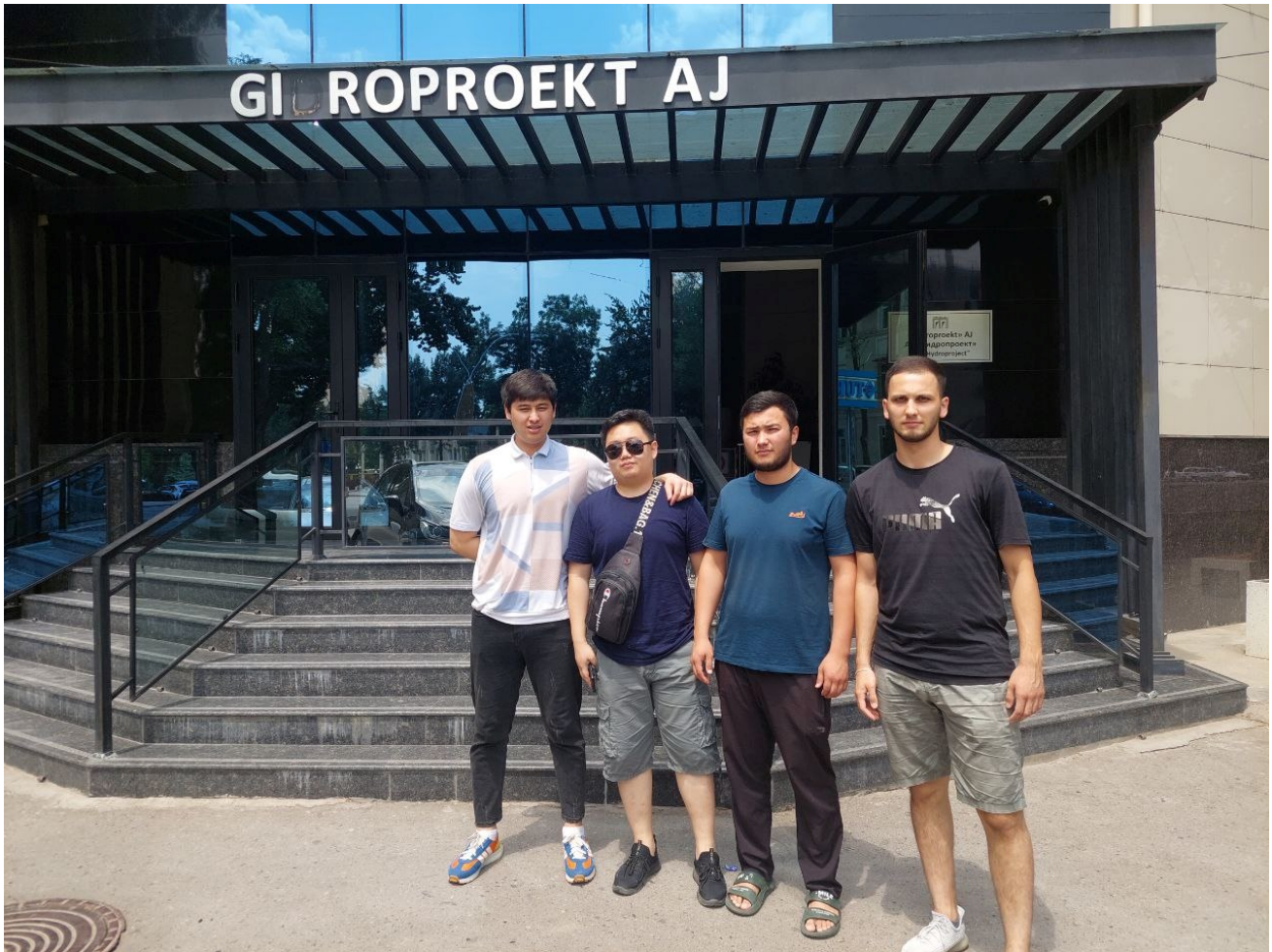
Photographs of production practice ("Hydroproekt" JSC)