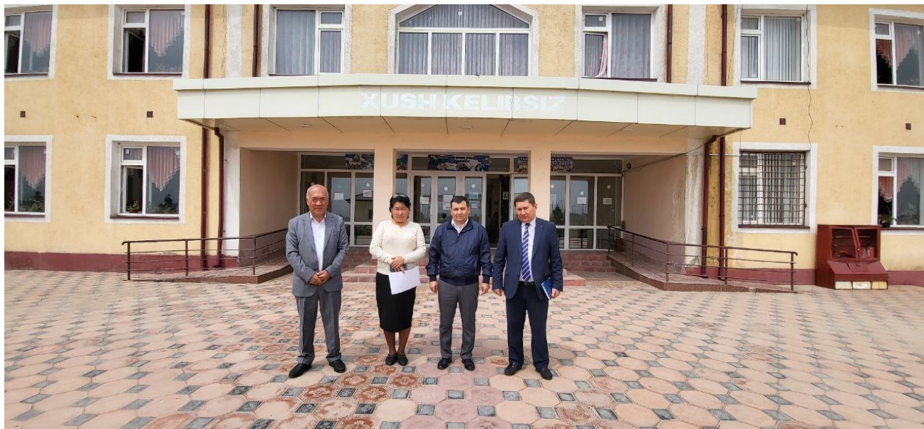
Visit to secondary school No. 3 of Pskent district, Tashkent region