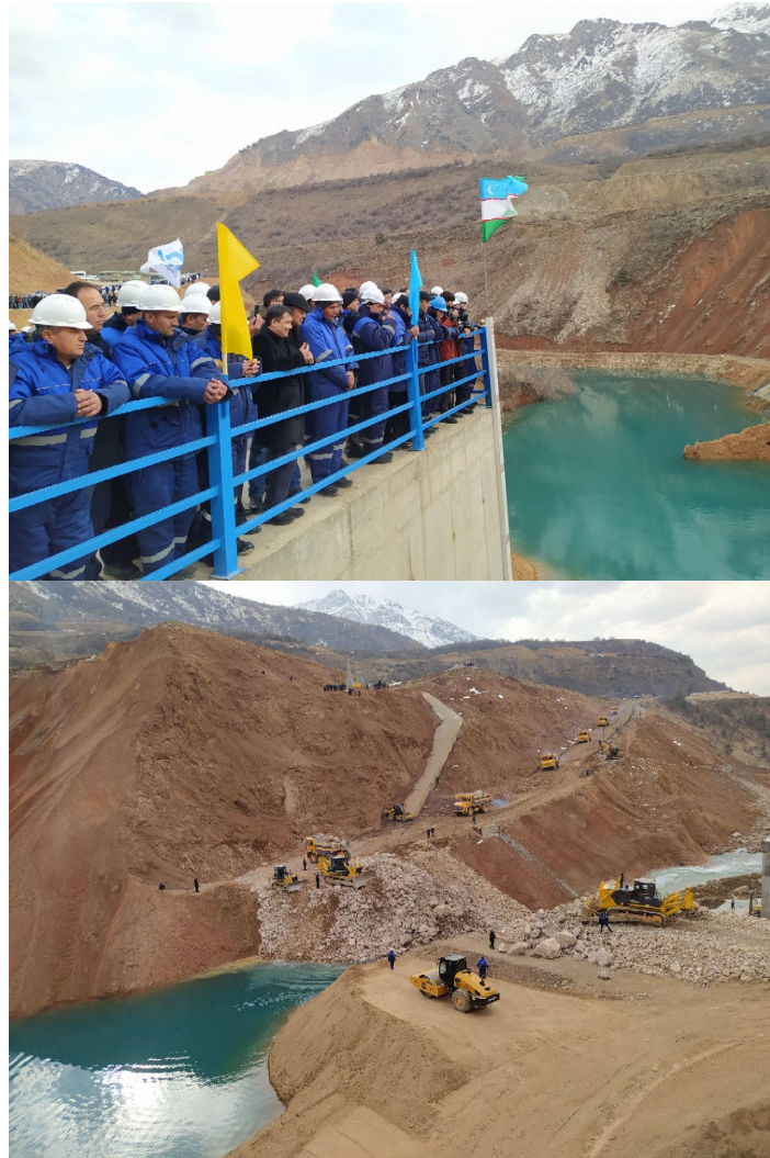
Photos from the visit of professors and teachers of the department to the construction site of the Pskom water reservoir in Tashkent region