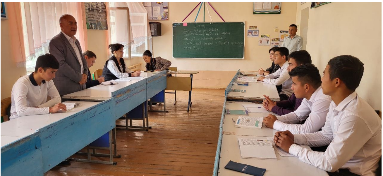
A roundtable discussion with graduates of secondary school #26 of Pskent district, Tashkent region