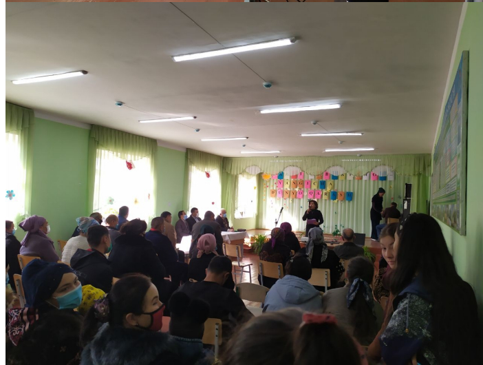
A roundtable discussion with students of secondary school No. 5 of Urtachirchik district, Tashkent region