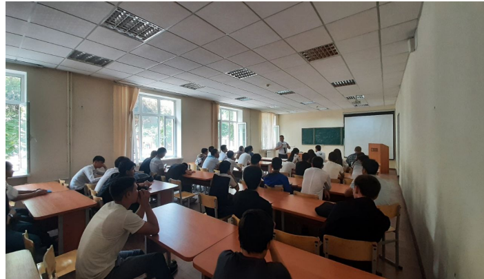
Photo sheets on educational practice (introduction to technical safety)