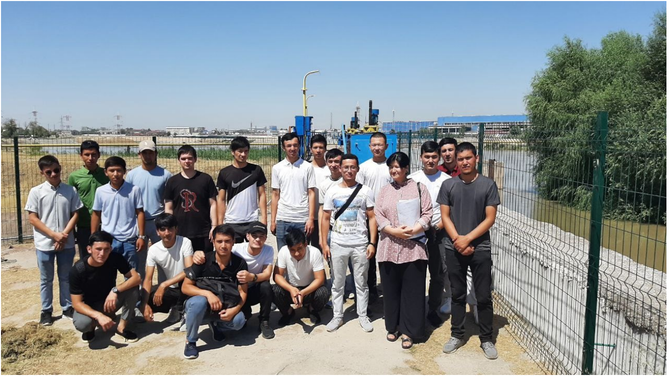
Photographs of educational practice (water intake link from the Chirchik river to the Bektemir canal)