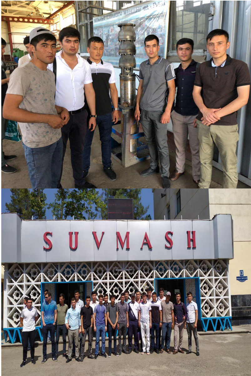
Students studying at GVP SUVMASH Pump Plant at GTQ and NSF courses