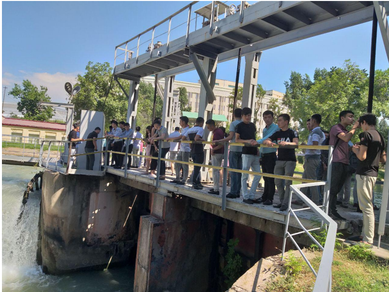
Students of "ITSEF" course of GTQ faculty are studying at "Bozsuv" hydropower station