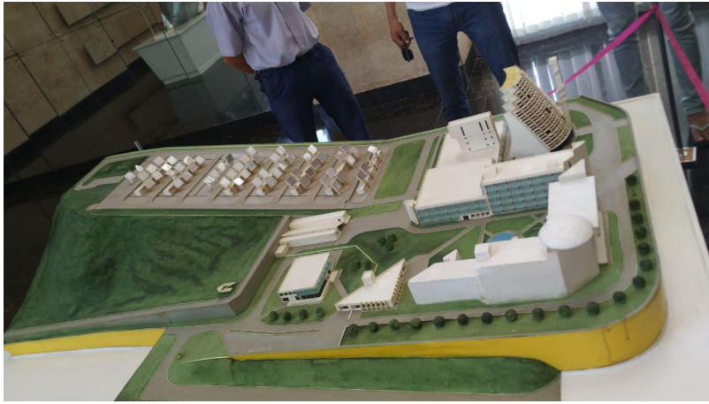
Students of "ITSEF" course of GTQ faculty are studying at the solar scientific research institute under the Academy of Sciences